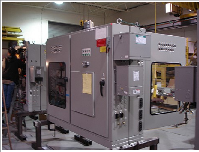
Henshaw builds advanced distributed controls panels for today's challenging manufacturing environment.