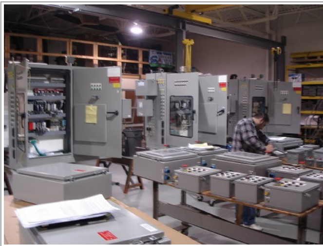
Henshaw has the ability to build simple one or two enclosures all the way to an entire body shop of panels.